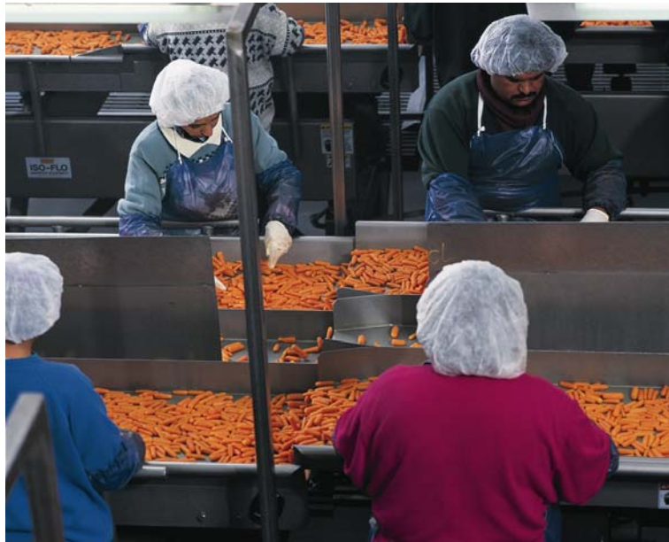
A Vibratory Inspection Conveyor

range of conveying solutions to choose from. With a deep and broad knowledge base, such a supplier can be a valuable resource in identifying the ideal conveying solutions that create competitive advantages by improving the performance on the production line. Because, if designed properly, conveyors can do much more than simply move product throughout the plant. Gentle handling, effective dewatering, and chilling, to cite just a few examples, can improve product quality and extend shelf life.