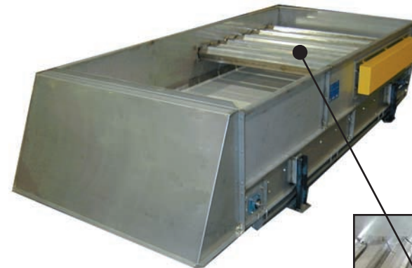
Star Roller Conveyor

If you process tobacco, let Key help. You will get the job done with no surprises, no hassles. And you will go home each day proud of your quality – and your bottom line!