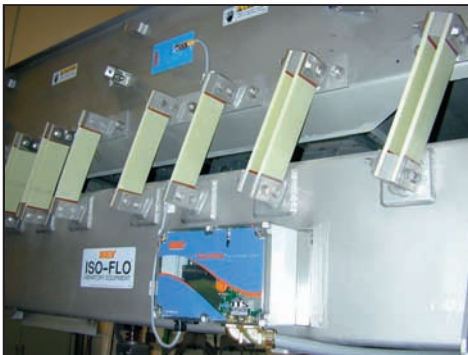
ITS™ installed on Iso-Flo arm

Key's Forté option simplifies and integrates control.