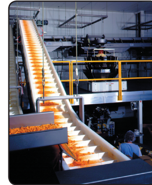
Plastic Belt Conveyor

Other applications may be used on this equipment. Call Key to find out about how your product(s) may benefit from this technology or another system.