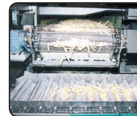
Wire-mesh Belt Conveyor