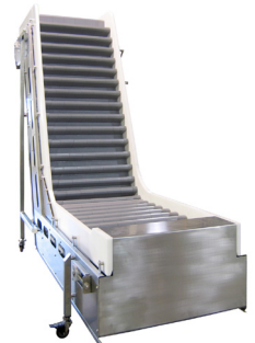
Modular Belt Conveyor