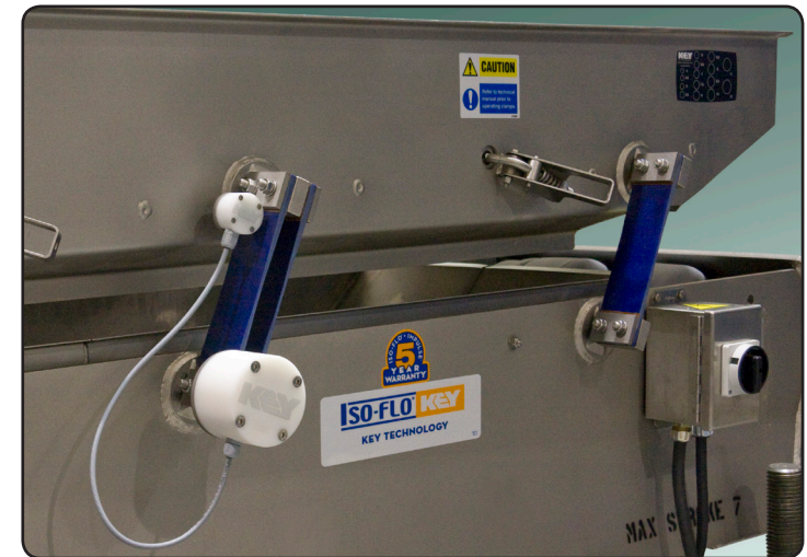
SmartArm® Installed on an Iso-Flo®