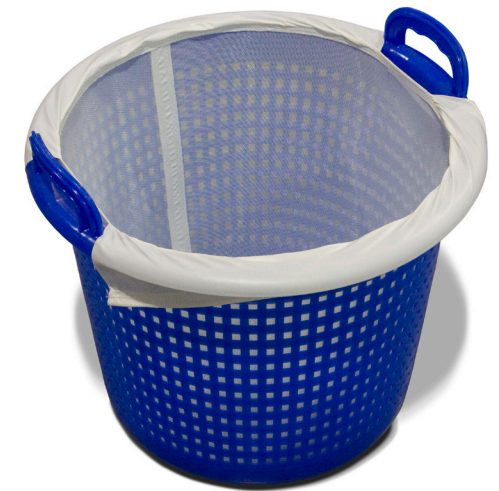
Basket with Liner Installed