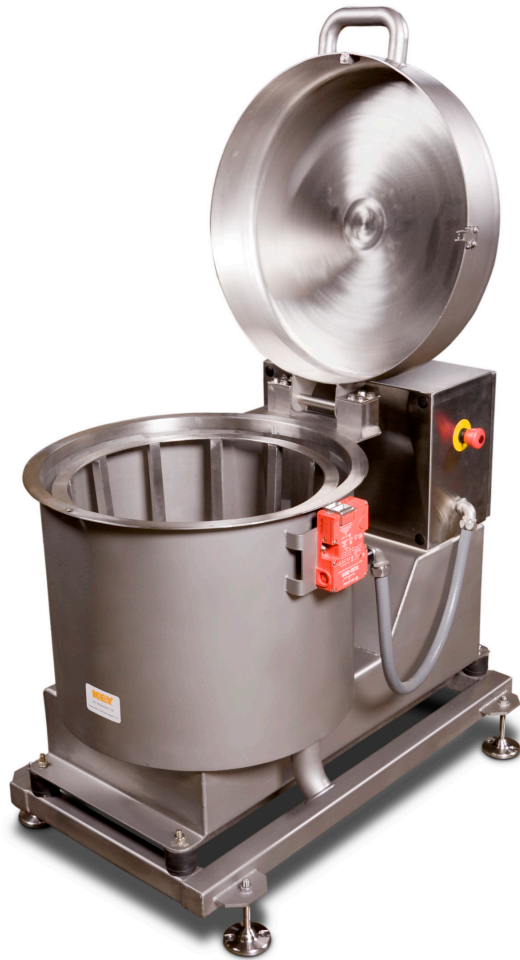
Compact Fresh-cut Dryer with lid open

Key's Compact Fresh-cut Dryer provides a flexible solution for removing water from a wide range of fresh-cut produce, enhancing your product quality and extending shelf life. Simple and efficient, the centrifugal design provides adjustable speed and time settings to optimize drying for leafy greens, cut vegetables, and herbs. Solid and dependable, the Compact Fresh-cut Dryer functions perfectly with Key's Fresh-cut Basket Wash and AVSealer Packaging and Sealing Machine to give you a full processing and packaging solution.