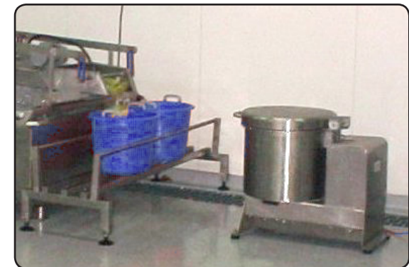
Compact Fresh-cut Dryer used together with Key's Wash System